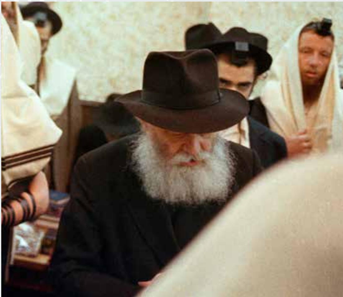
29 KISLEV 5746

the Rebbe's drive home, the Rebbe's car was parked at the entrance of the side door from which people pass by to receive lekach . This was done so the Rebbe would not have to walk more than necessary because of the foot pain. 3