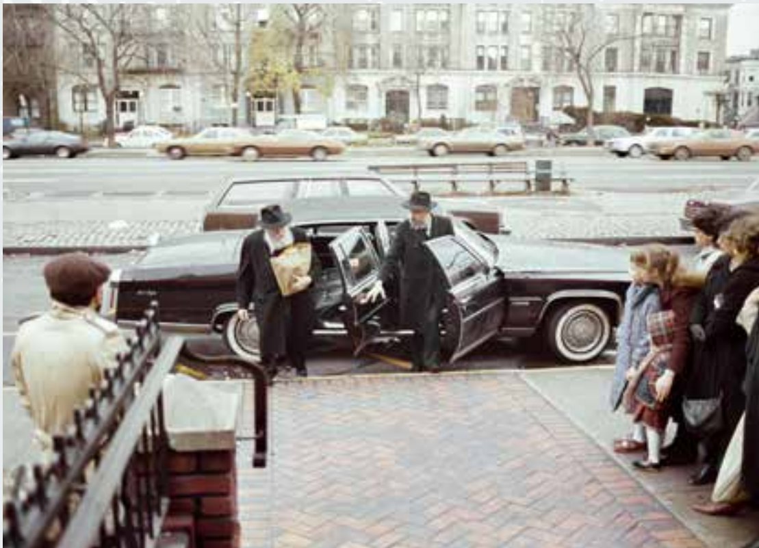
29 KISLEV 5746