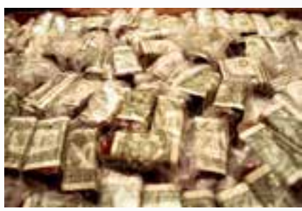
9 TISHREI 5751, CB HALBERSTAM VIA JEM 56009