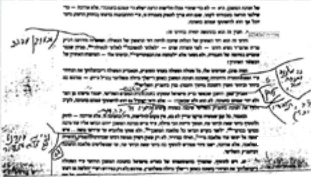
THE REBBE'S HAGAOS ON THE SICHA SAID DURING THE CHANUKAH LIVE PROGRAM, 5752*.

the shul downstairs, seating themselves upon the benches that filled the shul.