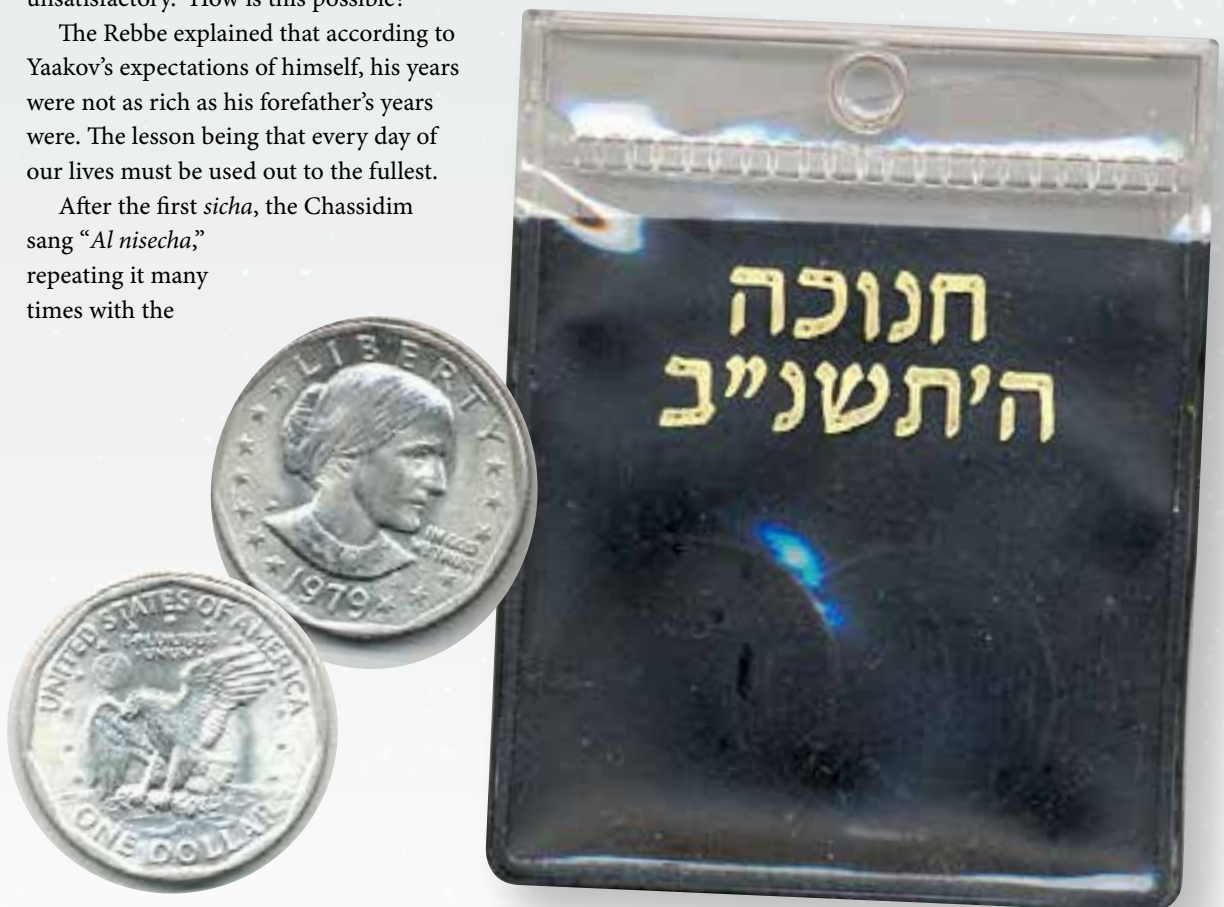
THE CHANUKAH GELT THE REBBE DISTRIBUTED ON SUNDAY, ROSH CHODESH TEVES 5752*, THE SEVENTH DAY OF CHANUKAH.