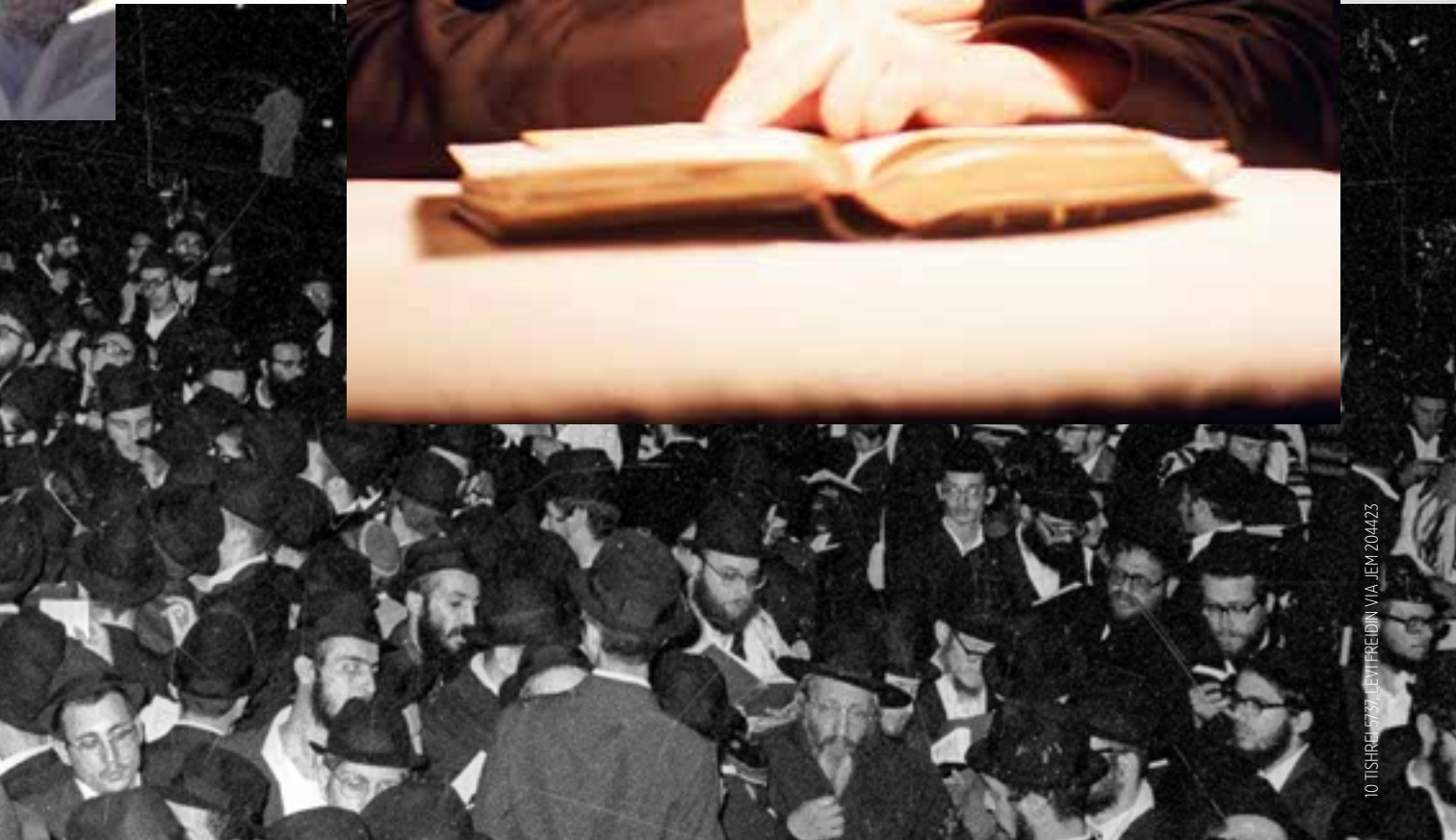
10 TISHREI 5737, LEVI FREIDIN VIA JEM 204423