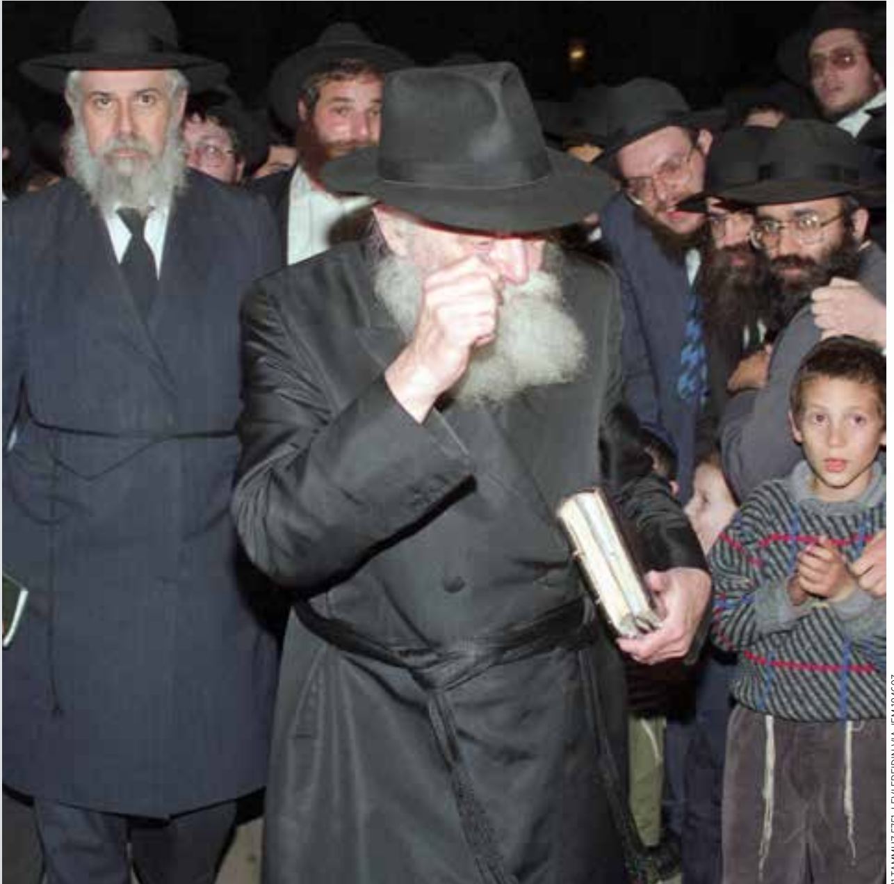
TI TAMMUZ 5751