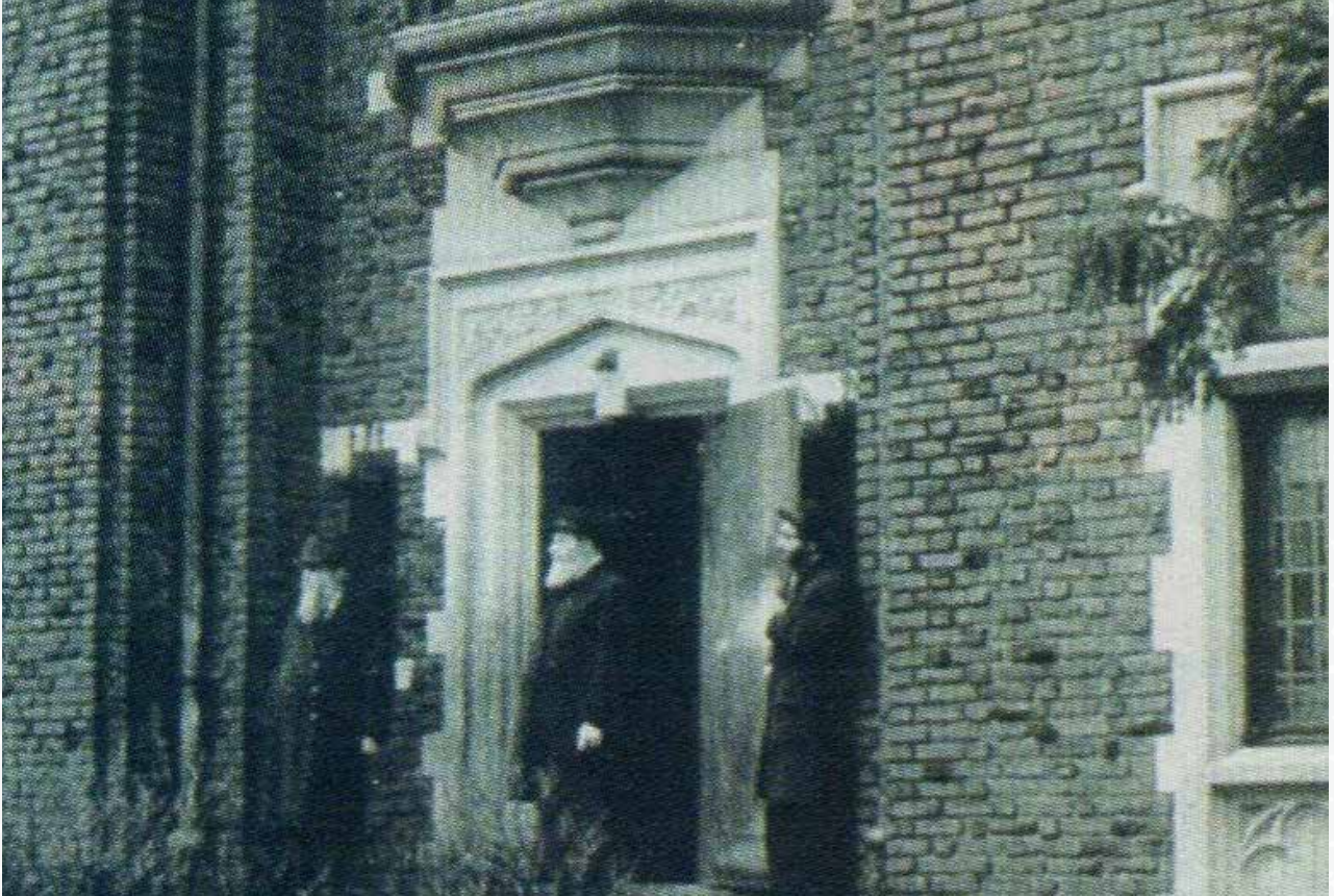
THE REBBE SEES OFF THE DEPARTING SHLUCHIM. 26 ADAR 1 5727

already have a building for it, however, it is uncertain exactly how it will work out, as the yeshiva wants to charge all of the talmidim several hundred dollars. The hanhala wrote to the Rebbe about this, and the Rebbe answered that they should discuss it with the bochurim . At this stage, it is unclear what will be.