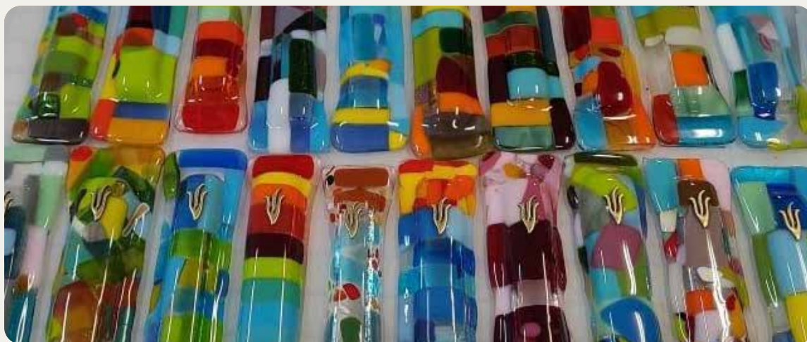
THE GLASS-INFUSED MEZUZAH CASES MADE AT THE JEWISH WOMEN'S CIRCLE EVENT AT CHABAD OF MERCER ISLAND, WA.