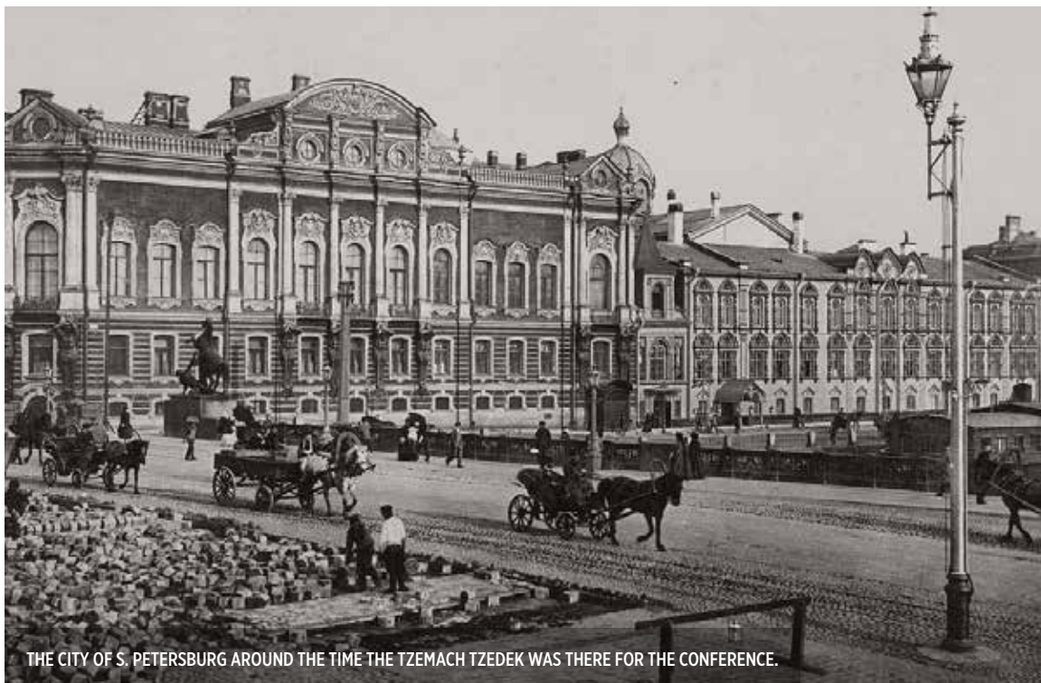
THE CITY OF S. PETERSBURG AROUND THE TIME THE TZEMACH TZEDEK WAS THERE FOR THE CONFERENCE.