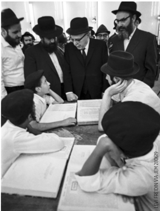
PRESIDENT SHAZAR CONVERSING WITH STUDENTS DURING A VISIT TO A CHABAD YESHIVA IN ERETZ YISROEL.

establishing a Chabad school network, writing, “And may the man who merited to establish mandatory education ( chinuch chovah ) also be meritorious in the area of education for mitzvos and Torah ( chinuch mitzvah v’Torah ).”]