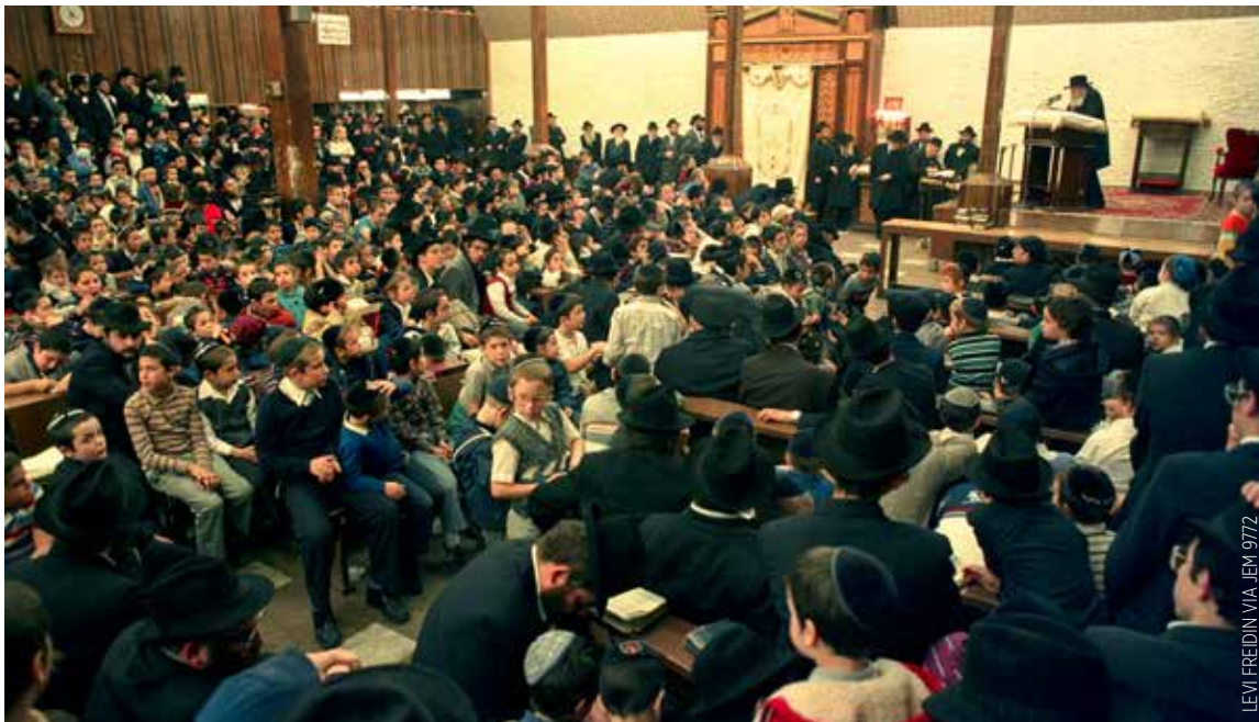
LEVI FREDIN VIA JEM 9772