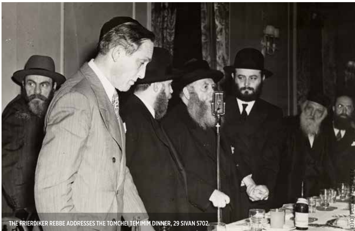
THE FRIEDIKER REBBE ADDRESSES THE TOMCHEI TEMIMIM DINNER, 29 SIVAN 5702.

It was during the 5500s* that the Jews of Germany, were exposed to a corruptive influence: the haskalah movement. Followers of the haskalah , calling themselves