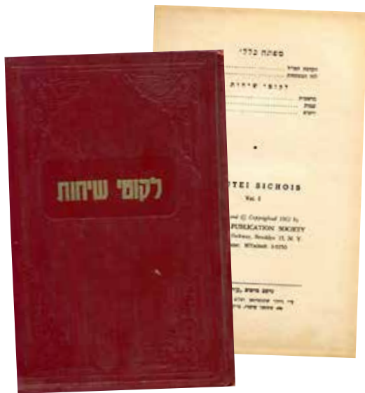
THE FIRST PRINTING OF LIKKUTEI SICHOS VOL. 1.