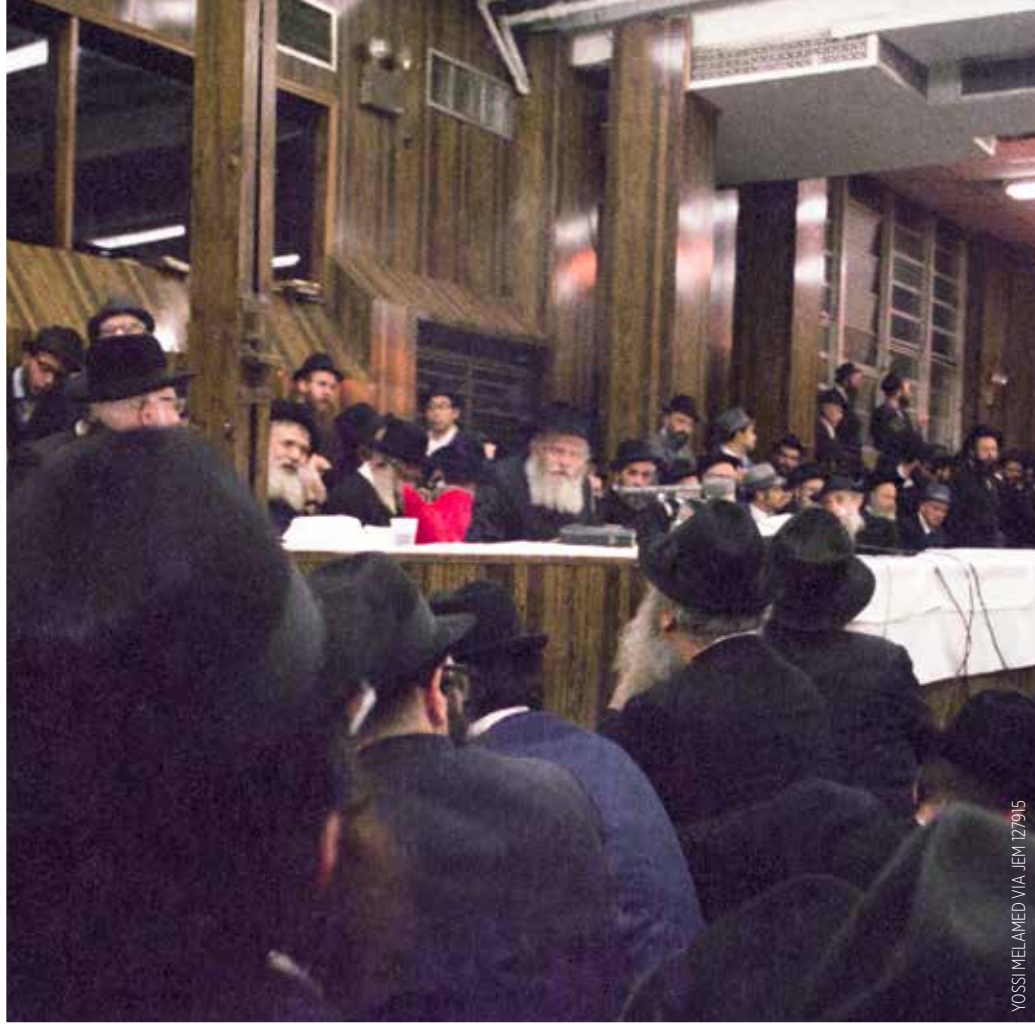
YOSSI MELAMED VIA JEM 127915