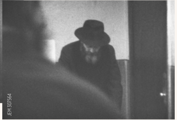
The Rebbe stands for Krias haTorah.